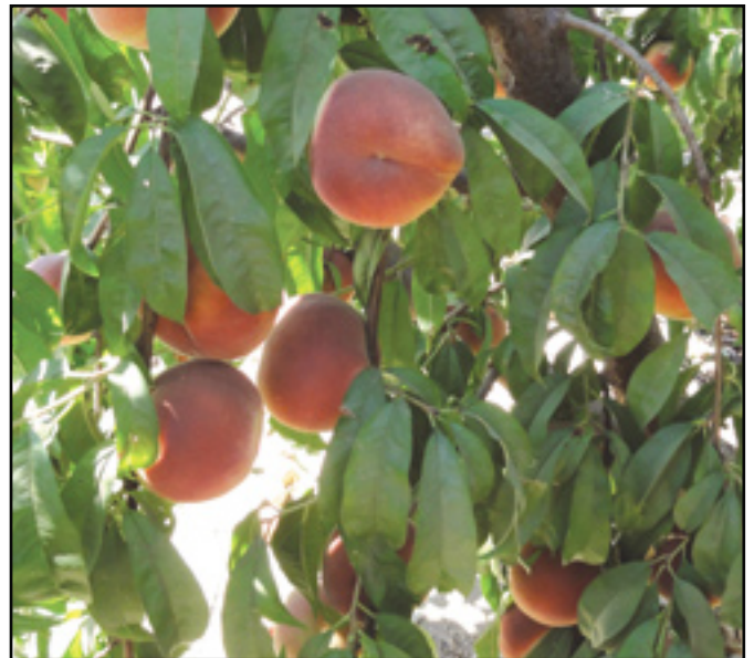
White Sub Acid Peach (E61.068)