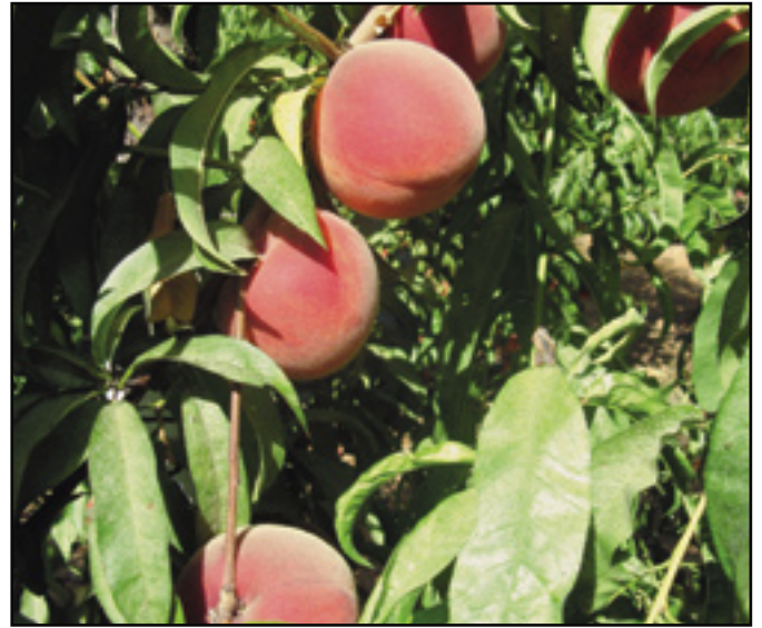
Classic Yellow Peach (P4.099)