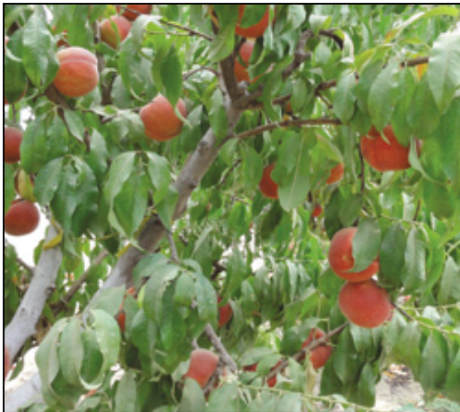
White Sub Acid Peach (M37.028)