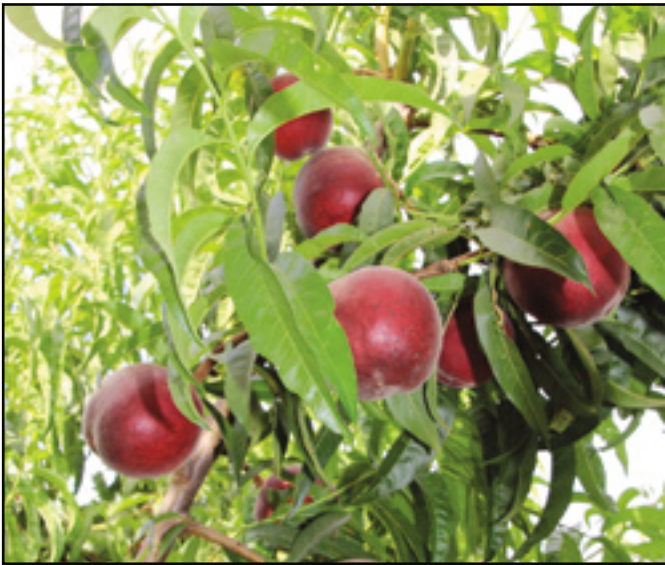
Classic Yellow Peach (E8.015)

What To Look Forward To In Your Future Orchard Plantings