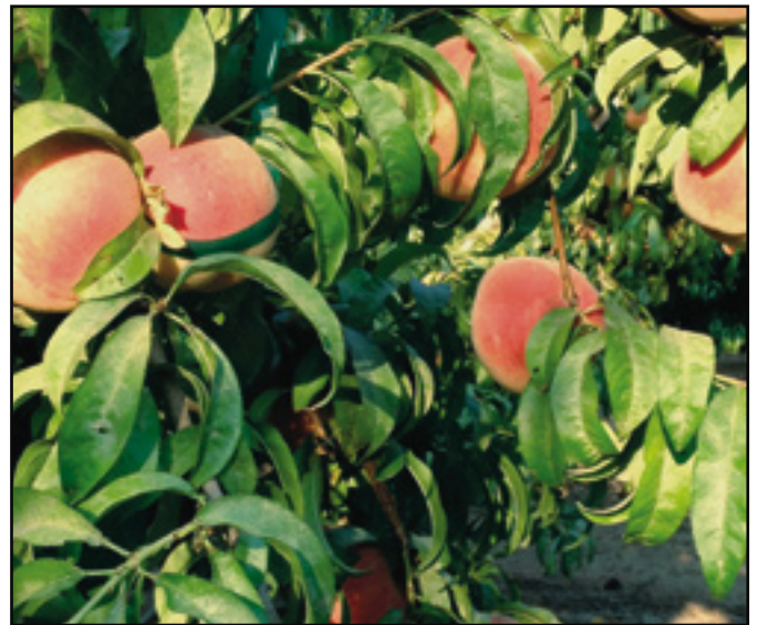
White Sub Acid Peach (P7.102)