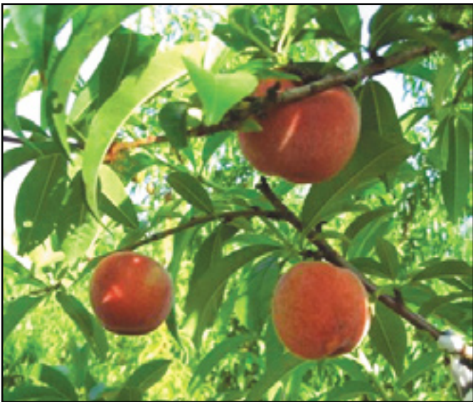
White Sub Acid Peach (Q57.058)