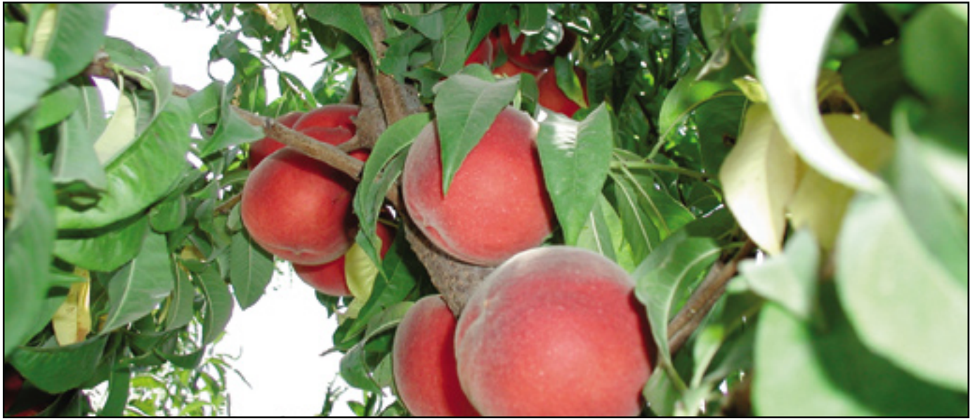
White Sub Acid Peach (E61.071)